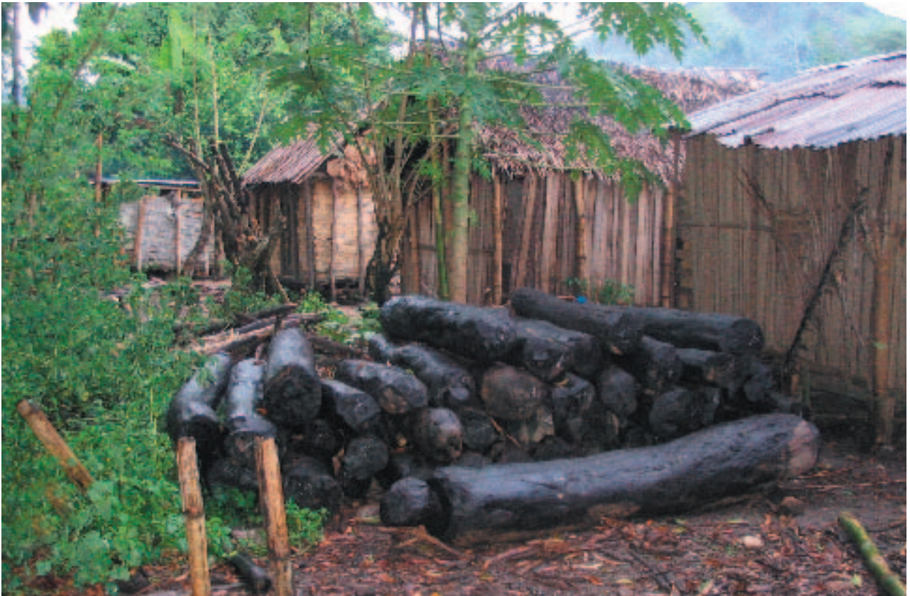
FIGURE 2. Rosewood logs cached near Mandena, 1 km from Marojejy National Park, anonymous.