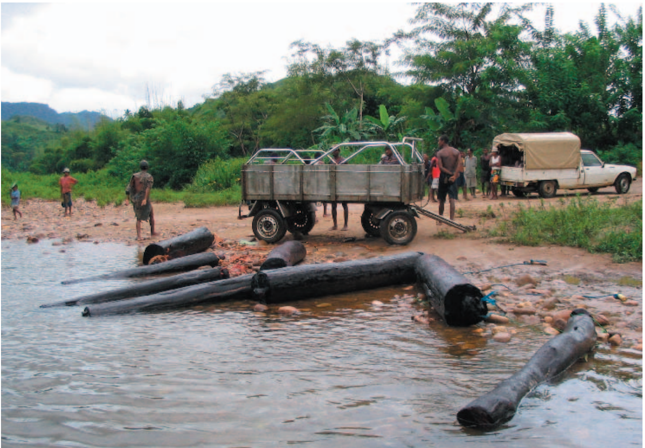
FIGURE 3. 4 km from Marojejy National Park, illegally logged rosewood being transferred from the Manantenina River to ground transport in broad daylight. March 30, 2005. 16:46, anonymous.