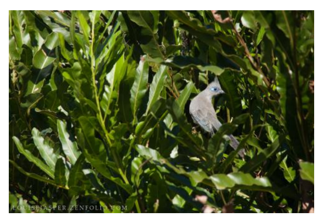
Figure 2. Verreaux's coua Coua verreauxi using aquatic vegetation (a bed of the fern Acrostichum aureum ), Onilahy River, 18 April 2013.

UNUSUAL INTERACTION BETWEEN FLEDGLING MADAGASCAR CUCKOO CUCULUS ROCHII AND ITS COMMON JERY NEOMIXIS TENELLA HOST. On 30 December 2012 at 1121h, between Talatakely and Vatoharanana in Ranomafana National Park (approx. E047° 25′ 30″, S21° 16′ 34″, Haute Matsiatra Region), we observed an interaction involving a fledgling Madagascar cuckoo and its host, a Common jery (Figure 3). The host perched next to the cuckoo and began feeding it, but within 1 sec the cuckoo had