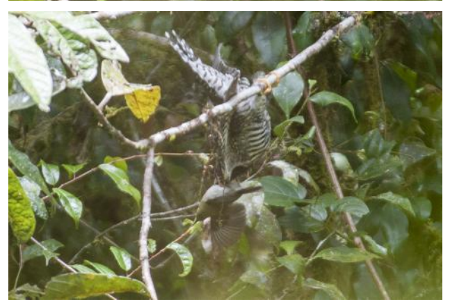
Figure 3. Sequence of images showing the temporary capture of a Common jery Neomixis tenella host by a fledgling Madagascar cuckoo Cuculus rochii , Ranomafana National Park, Madagascar, 30 December 2012.

grasped the jery by the leg with its bill. The host immediately began struggling, unbalancing the cuckoo from its perch. However, the cuckoo retained its grip on the jery while dangling suspended from the branch. After 4–5 sec of continued struggle, the cuckoo released its grip on the branch and fell, at which point the jery escaped.