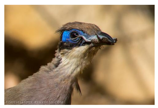
Figure 1. Green-capped coua Coua ruficeps olivaceiceps predating a Madagascar girdled lizard Tracheloptychus madagascariensis , Arboretum Antsokay, southwest Madagascar. 6 April 2014.

The nine extant species of Coua are omnivorous, feeding on insects and other invertebrates, plant matter (fruits, flower buds, seeds, tree gum), small reptiles (skinks, geckos, chameleons) and the eggs of reptiles and birds (Milon et al. 1973, Goodman et al. 1997, Safford and Hawkins 2013). However, this is the first record of vertebrate carnivory in either subspecies of Coua ruficeps (Safford and Hawkins 2013). The only remaining coua species not known to consume vertebrates is the Running coua Coua cursor (Safford and Hawkins 2013); but this may simply reflect a lack of observations.