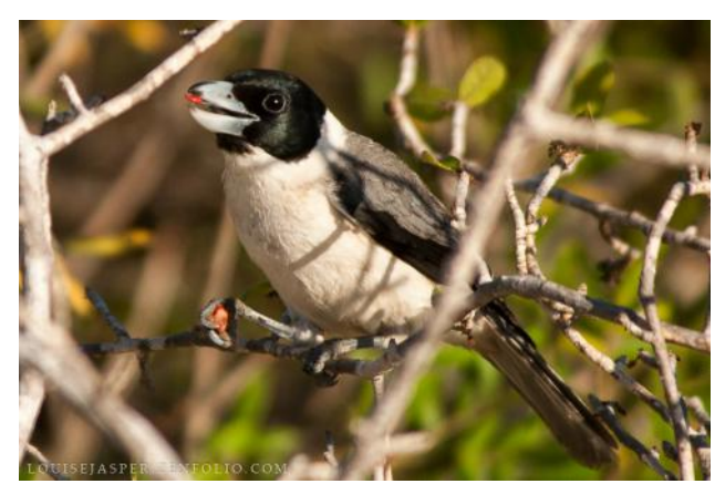
Figure 5. Male Lafresnaye's vanga Xenopirostris xenopirostris eating fruit of Commiphora Iamii , Anakao, 25 November 2012.

Members of the Vangidae are primarily insectivorous, though the larger species take vertebrates and "a few species consume at least some fruit" (Schulenberg 2013a). Species recorded eating fruit include Madagascar blue vanga, Chabert vanga Leptopterus chabert (including red arils of Commiphora fruit), Bernier's vanga Oriola bernieri and White-headed vanga (Benson et al. 1977, Böhning-Gaese et al. 1995, 1999, Schulenberg 2013b, Schulenberg and Hawkins 2013b): our observation is the first record of frugivory in the genus Xenopirostris . The 44 Malagasy species of Commiphora are widespread in the country's dry regions (Schatz 2008, Gostel et al. 2016). The oily, energy-rich arils are consumed by birds including the Lesser vasa parrot Coracopsis nigra , Greater vasa parrot C. vasa , Common jery and now three species of vanga, as well as a lemur (Verreaux's sifaka Propithecus verreauxi ), and the ant Aphaenogaster swammerdami (Böhning-Gaese et al. 1995, 1999).