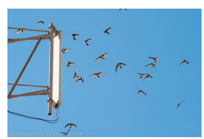
Figure 4. Flock of Alpine swift Tachymarptis melba flying around emitter of telecommunications tower in Belalanda, southwest Madagascar, 28 May 2012.

MOBBING OF CHAMELEON BY SOUIMANGA SUNBIRD NECTARINIA SOUIMANGA. At 1120h on 14 April 2015, on the southernmost limestone karst (tsingy) outcrop of the Ankarana Massif (E048° 59' 06", S13° 03' 45", Diana Region), we observed two adults and one juvenile Souimanga sunbird mobbing a large panther chameleon Furcifer pardalis (Chamaeleonidae; total length <38 cm, Glaw and Vences 2007). All three birds were alarm calling from branches to the side of and behind the chameleon, and flew above and around it for several minutes, but did not approach it from the front. Safford (2013b) notes that Souimanga sunbird is aggressive and may relentlessly mob predators, singly or in groups. Our observations show that Souimanga sunbirds recognize large chameleons as potential predators, however we are aware of only one record of a chameleon (Furcifer oustaleti) predating birds in Madagascar (García and Vences 2002).