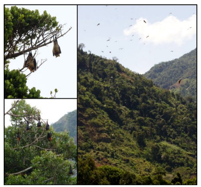
Figure 2. Roosting and disturbed Madagascan flying foxes ( Pteropus rufus ) at the Amborabao colony, assessed during this study (September 2015).

ANALALAVA (ANTRANOPANIHY). This unprotected parcel of littoral forest is relatively isolated, situated on a small island cut off by the arms of an estuary (Asihanaky), making it accessible only by pirogue. The forest and roost are ca. 3.6km from the nearest village, Ambanihazo and at an altitude of just 15m. Our colony